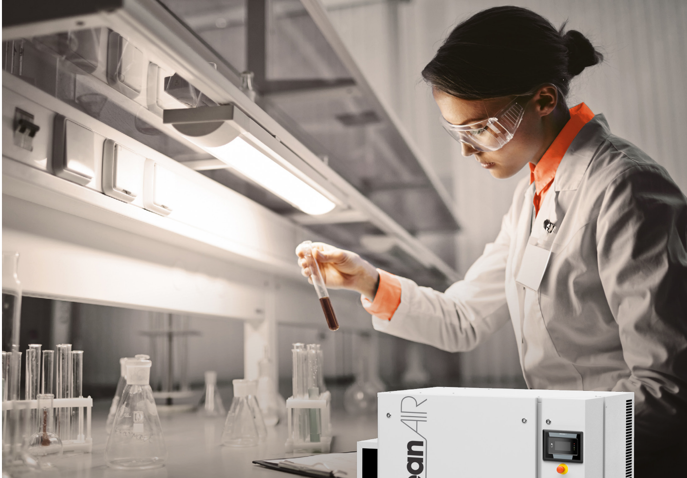
CNR 75-100 OIL-FREE COMPRESSORS